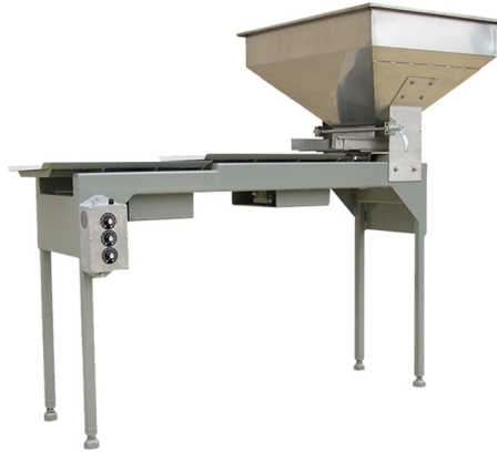
2 STEP INSPECTION TABLE Model Number: ME-EVT-2N-1324