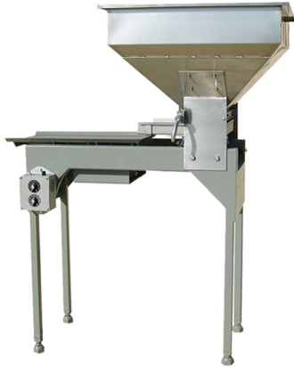
1 STEP INSPECTION TABLE Model Number: ME-EVT-1N-1324